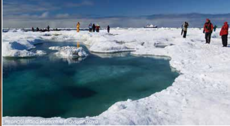
Wrangel Island Reserve