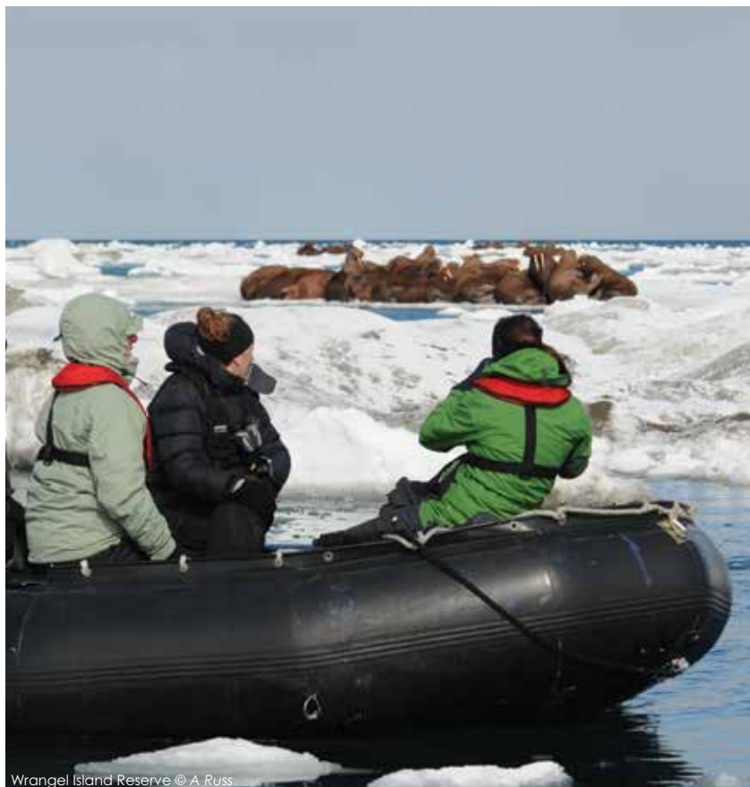
Wrangel Island Reserve

This expedition is subject to approval from various Russian Federal and Regional Authorities and may have to change depending on these approvals. Permits have been lodged for all the sites mentioned in the itinerary, depending on approvals these may have to be amended or substituted. We will endeavour to keep participants fully informed of any changes in the itinerary as and when they occur.