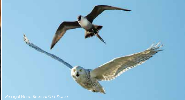
Wrangel Island Reserve