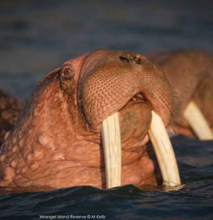
Wrangel Island Reserve